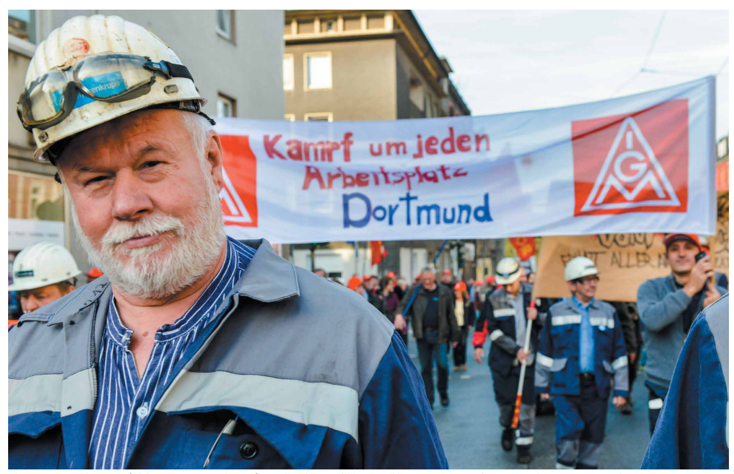
The more people made jobless or put on short-time, the bigger will be the discontent (photo of a steelworkers' demonstration)

unlike anything we have ever experienced in our lifetime, and only a rudimentary estimate can be made of the disruptions this will cause for our societies."