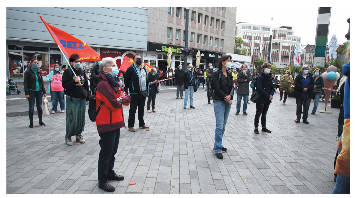
The Monday demos now take place again regularly, here in Gelsenkirchen - of course, with corona protection

However, the government has failed to take the most important measures that would have been necessary for mass health protection. In the first place, these would have been mass and regular testing of the population; secondly, strict social distancing; and thirdly, decent face masks for every person. And not just a mouth and nose mask, which provides only limited protection, but FFP2 and FFP3 masks, which provide real protection. But the government was not in a position to do this. And why? Because it had ignored all WHO pandemic preparedness warnings. As early as 2012, the WHO had predicted that such pandemics could occur and had made it clear what crisis