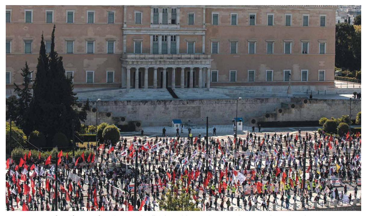
May Day was a signal internationally - carrying fighting spirit onto the streets in corona times - here in Greece

It is possible that a deep global political crisis such as has not been the case since the Second World War is imminent. In such a crisis, mass struggles and strikes will break out; there will be street battles and brutal police operations against the masses. In Latin America or Africa such a development is already in the making today. There, millions are starving; there is no