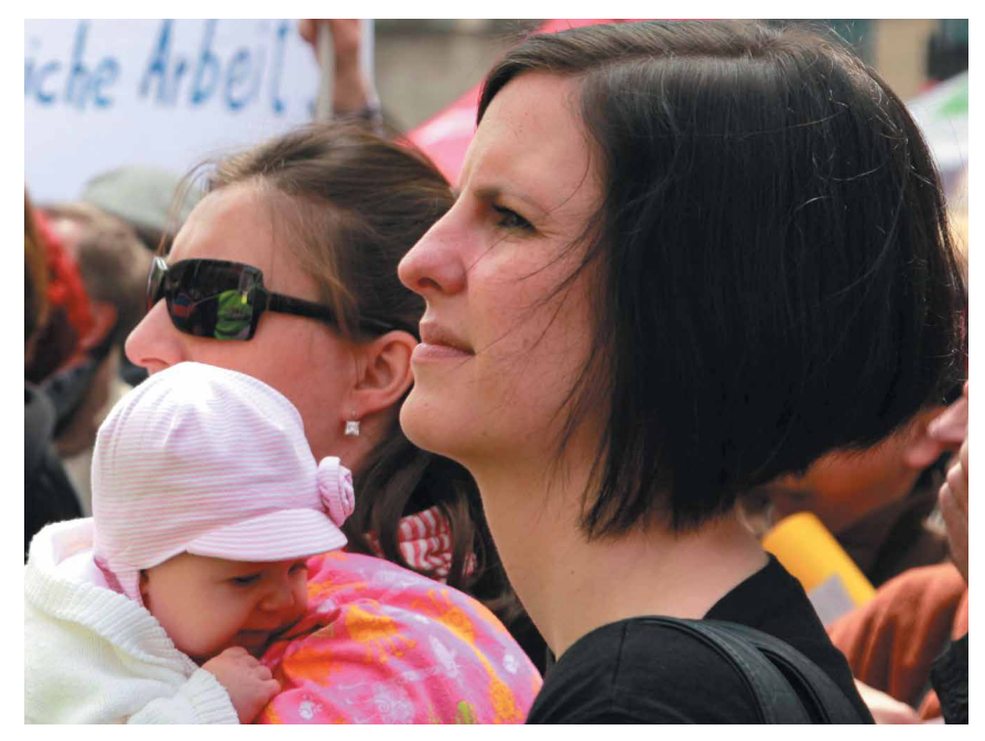
Take heart - the future of children is also at stake!

Take heart, join this solidarity movement and the common struggle. Glückauf! Good luck!